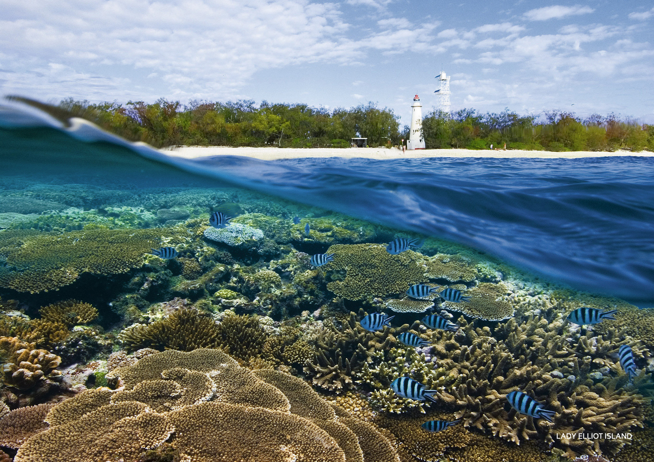
LADY ELLIOT ISLAND