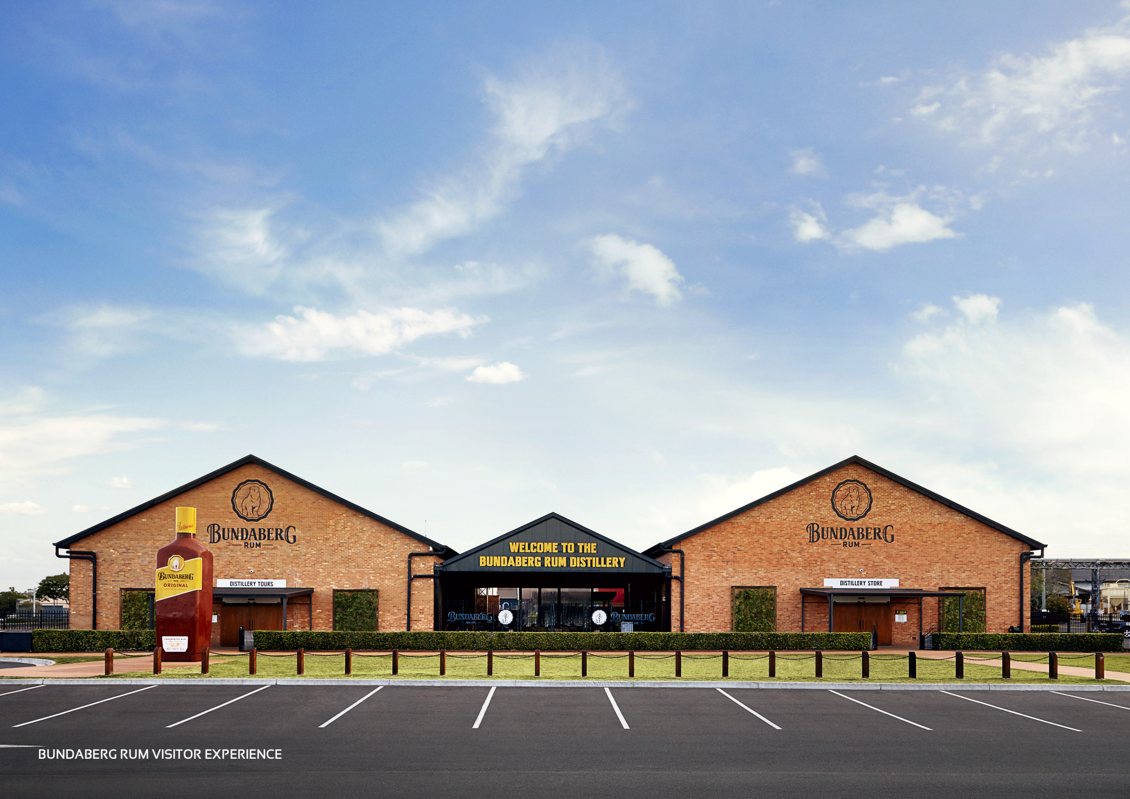
BUNDABERG RUM VISITOR EXPERIENCE