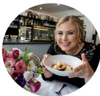
WATER ST KITCHEN