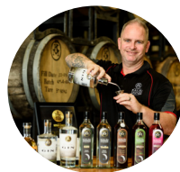
KALKI MOON DISTILLING CO