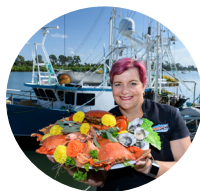
GRUNSKES BY THE RIVER SEAFOOD