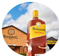
BUNDABERG RUM DISTILLERY