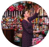
CHA CHA CHOCOLATE