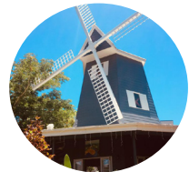
WINDMILL CAFE BARGARA

What better way to explore our region and experience a taste of Bundaberg than by planning the ultimate picnic? Fill up your baskets with fresh local eats and drinks before making your way to one of our many pristine beaches for a day spent in paradise.