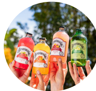
BUNDABERG BREWED DRINKS