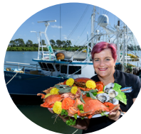
GRUNSKES BY THE RIVER