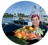
GRUNSKES BY THE RIVER