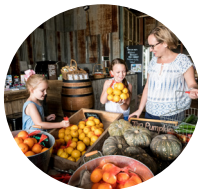
ALLOWAY FARM MARKET