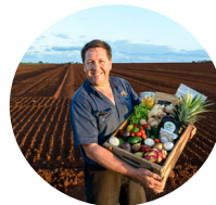
ONE LITTLE FARM

Explore our region one farm gate at a time and experience a delectable culinary experience delivered straight from the farm to your kitchen. Taste the freshness on the tip of your tongue as you prepare a feast for the senses with freshly picked strawberries, mouth-watering macadamias, fresh figs and more. We're sure you'll be able to taste the difference.