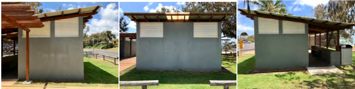
Building 1: Stage 1 wall

Section 1: 3 panels. Section 2: 5 panels. Section 3: 3 panels. Total 11 panels (approx 16.5 square metres)