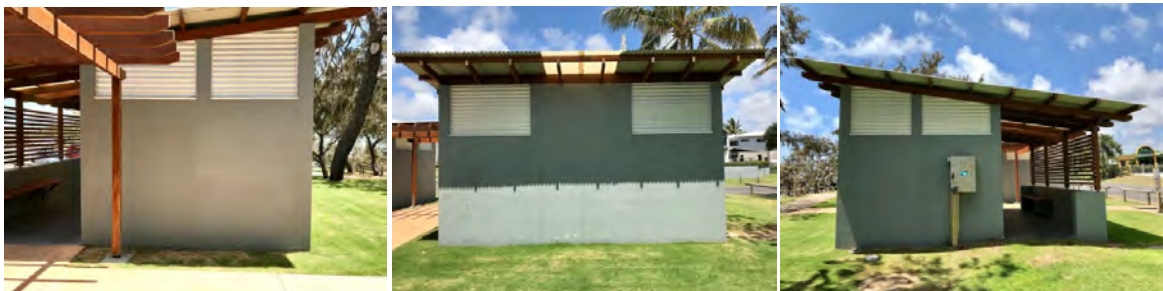
Building 2: Stage 1 wall

Section 1: 3 panels. Section 2: 5 panels. Section 3: 2 panels. Total 10 panels (approx 16.5 square metres)