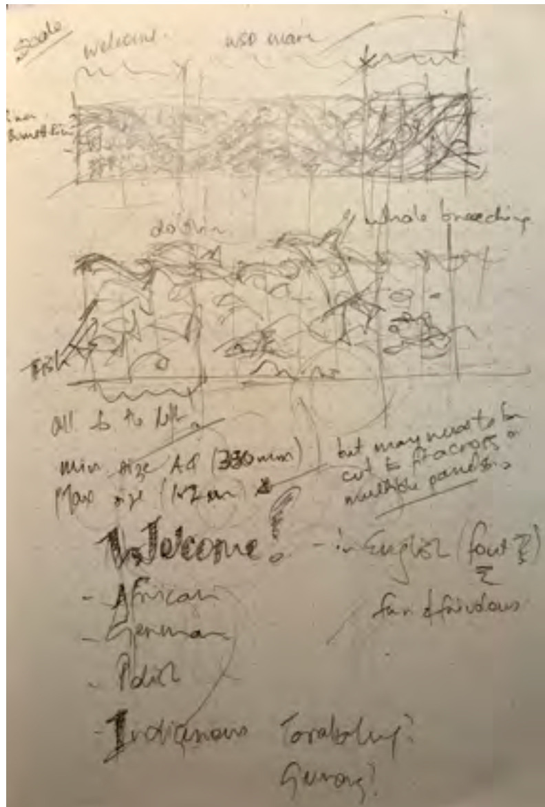
Page from my notebook with initial concept development ideas