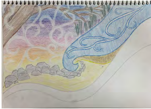
Keppock State High School's design by Sapphire Hafemeister