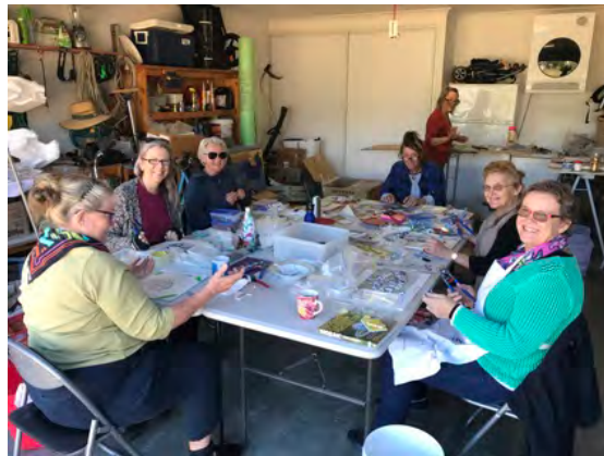
Mosaic skill building and 'fish' making workshop

As a result more residents joined the mosaic workshops and 'fish' building became more interesting, sophisticated, and challenging. The 'fish' were all built on mesh and stored away waiting project funding.