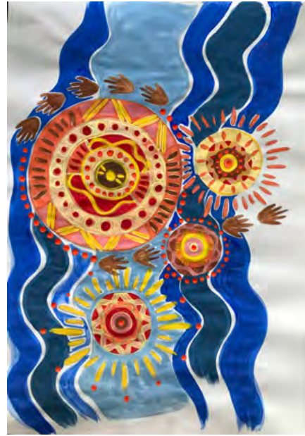
Positive living communities (Sun symbols). Intergenerational