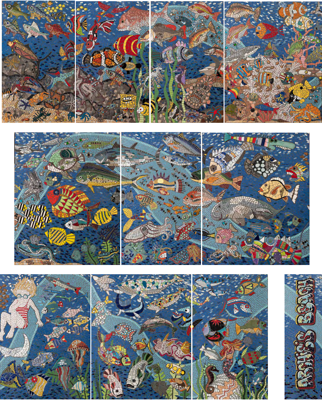
Fish Tales wall panels