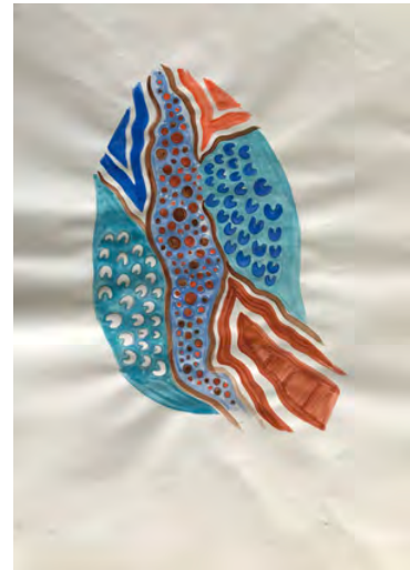
Coastal people songlines – generations of stories of living by the sea