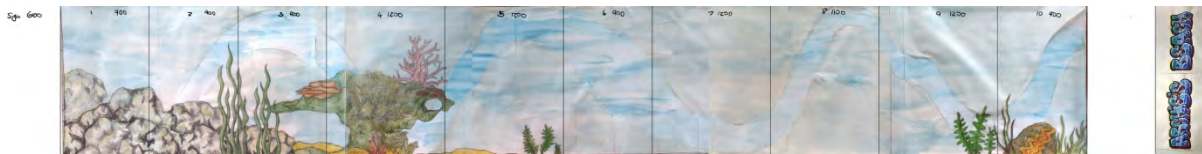
Fish Tales wall layout. Note the repetition of the linking 'ribbon' through the design.

My brief was pretty simple: draw an underwater reef scene that we could place the mosaic fish and other sea creatures onto. I enjoyed including a variety of reef forms, shapes and spaces for the different sea creatures to feature. The lovely giant clam was a feature drawing on memories of snorkelling on the GBR up north. We are so lucky here in Bundaberg to be the gateway to the Southern Great Barrier Reef. (Julie Hylands)