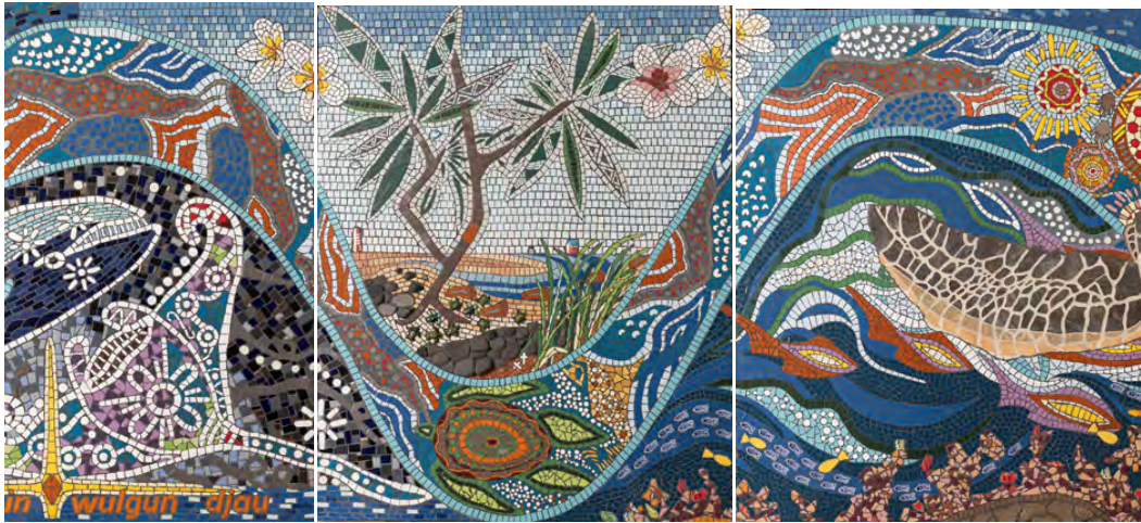
South Sea Islander panel