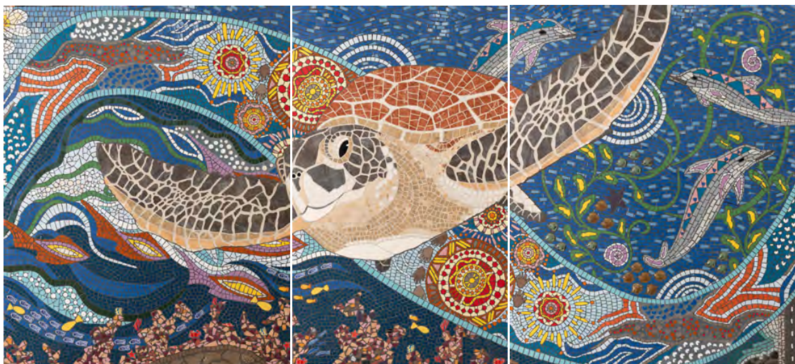
Welcome wall feature panel