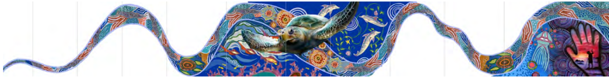
Welcome wall layout showing spaces for panels designed/made by schools and Indigenous groups