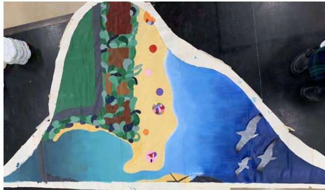
St Luke's Anglican College design by The Dream Team