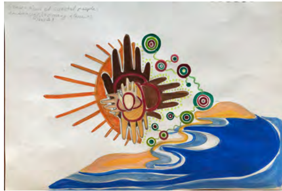
Generation of coastal people embracing sea life and its many elements