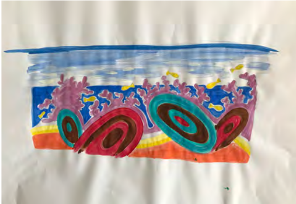
Reef - minimal/child- friendly design