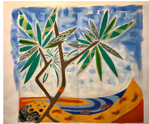
Coastal pandanas – reflecting Islander memories