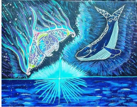
Night Sky Dreaming – Stacie Saltner

This panel is based on a painting by Stacie Saltner.