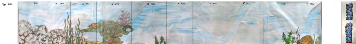
Fish Tales wall layout. Note the repetition of the linking 'ribbon' through the design.

My brief was pretty simple: draw an underwater reef scene that we could place the mosaic fish and other sea creatures onto. I enjoyed including a variety of reef forms, shapes and spaces for the different sea creatures to feature. The lovely giant clam was a feature drawing on memories of snorkelling on the GBR up north. We are so lucky here in Bundaberg to be the gateway to the Southern Great Barrier Reef. (Julie Hylands)