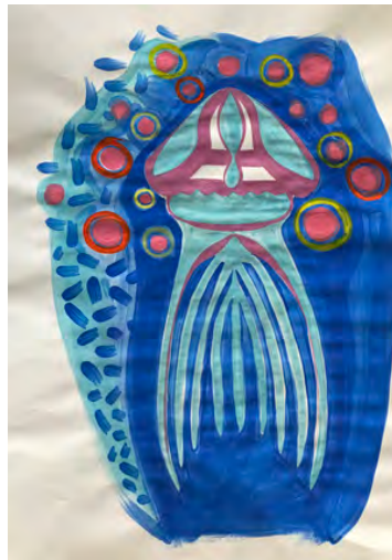
Jellyfish drifting by