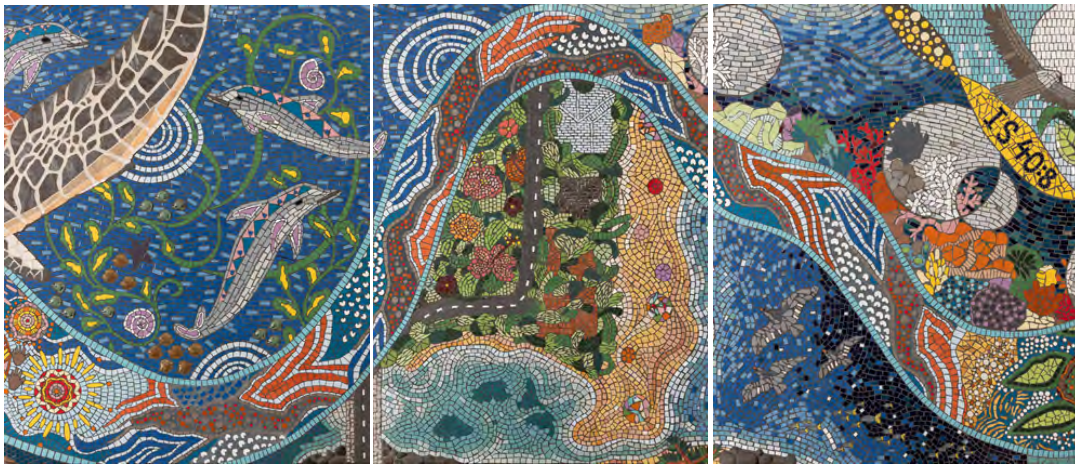
St Luke's Anglican College panel