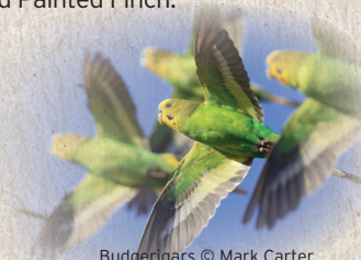
Budgerigars