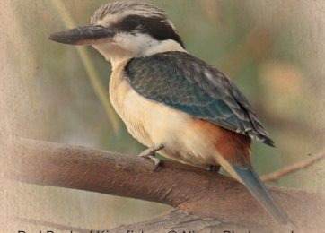
Red Backed Kingfisher