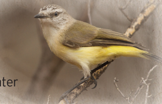
Yellow-rumped Thornbill