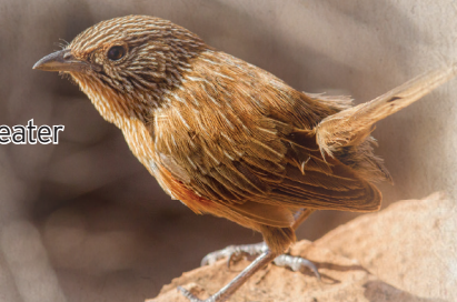
Dusky Grasswren