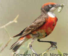
Crimson Chat

MARK CARTER BIRDING AND WILDLIFE.COM BIRD TOURS WILDLIFE PHOTO TOURS