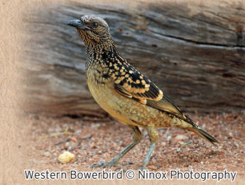
Western Bowerbird