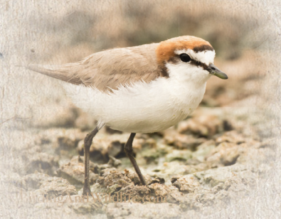
Red-capped Plover

*Access to this site is conditional. All visitors must contact Tourism Central Australia for a list of accredited guides who can facilitate entry. Costs may apply.