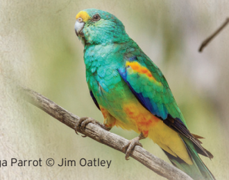
Mulga Parrot