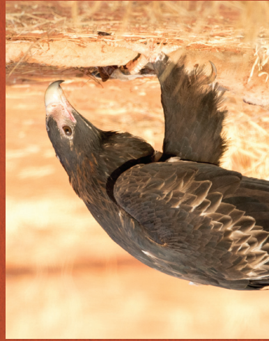
Wedge-tailed Eagle

Alice Springs and its surrounding area is a fantastic birding destination. The desert landscape of Central Australia is home to 180 bird species in a range of spectacular habitats from sandstone rock formations, arid woodlands, sandy flats, waterholes and spinifex grasslands.