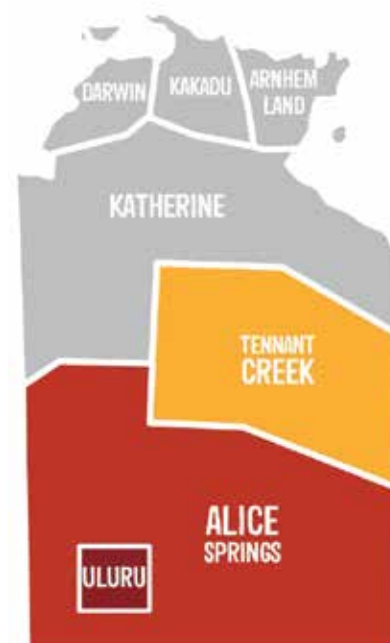
Tourism Central Australia's Northern Territory Government funded operating area