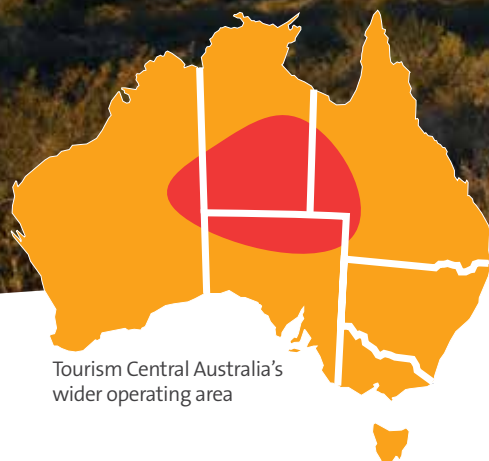
Tourism Central Australia's wider operating area