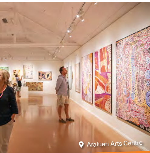
Araluen Arts Centre

One of the most asked questions that we get in the Information Centre is “what should we do in Alice Springs?” and the hardest part about answering this question is it depends on your interests. So we’ve put together this guide of things you could do in Alice Springs to suit you.