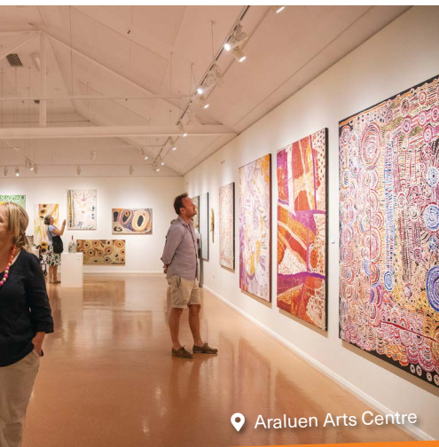
Araluen Arts Centre

One of the most asked questions that we get in the Information Centre is “what should we do in Alice Springs?” and the hardest part about answering this question is it depends on your interests. So we’ve put together this guide of things you could do in Alice Springs to suit you.