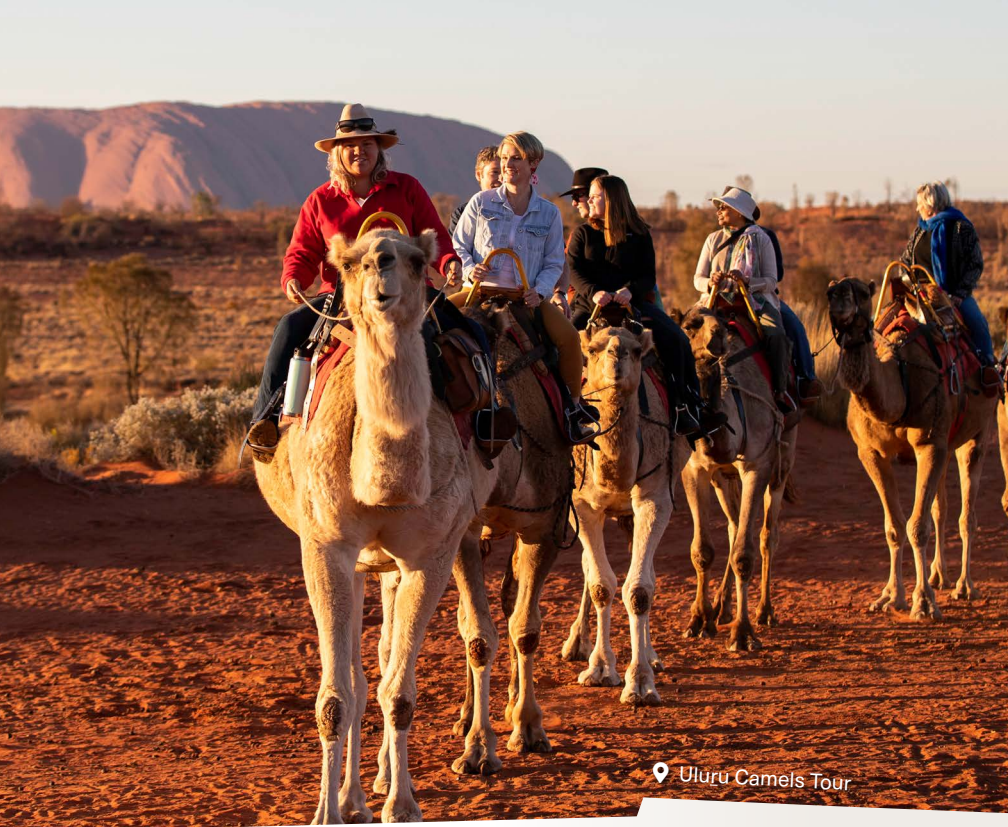
📍 Uluru Camels Tour