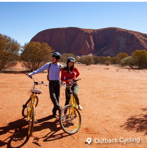
📍 Outback Cycling

Or, if you're ready to try something a little bit different, Uluru Segway Tours provide a range of guided tour options all with Segway's as your transportation. Whether you want a full guided tour around the whole base of Uluru or you just want to experience a section of it, there is sure to be something up your alley.