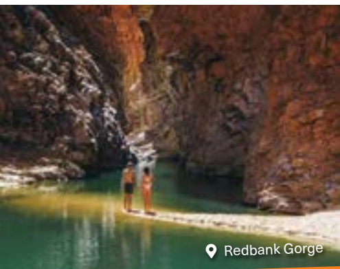
📍 Redbank Gorge