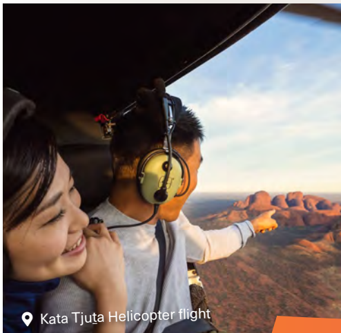
📍 Kata Tjuta Helicopter flight