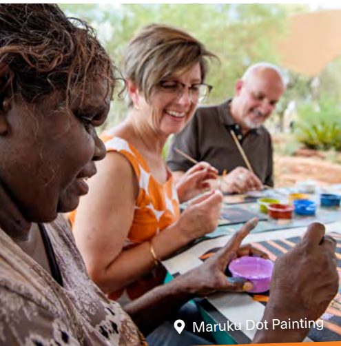
📍 Maruku Dot Painting

When you're down at 'The Rock' there is plenty to keep you busy. Here is our guide to some of the things on offer for you.