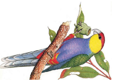
Red-capped Parrot (male)

A 68 ha reserve of mixed woodland with Marri, Jarrah, Wandoo, Mallet and sheoak on the outskirts of Narrogin. There are several entry points (see the web ref below for details). One of them is opposite the caravan park on Williams Rd. There are three picnic areas, which are starting points for five unsealed walk trails. These cover gravels with mesas & breakaways, granite rocks & sandplain. NB Some trails contain steps. The area is noted for flora (best between Aug & Oct) and fauna, including 85 species of birds. Birds include Red-capped Parrot, Rufous Treecreeper, Regent Parrot, Red-tailed, Carnaby's & Baudin's Black-Cockatoos, Tawny-crowned and White-cheeked Honeyeaters, Western Wattlebird and Varied Sittella.