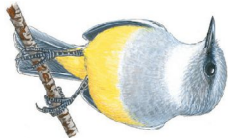
Western Yellow Robin (male)

Over ninety species of birds include Square-tailed Kite, Common and Brush Bronzewing, Western Yellow Robin, Yellow-plumed Honeyeater and Rufous Treecreeper. https://www.pingelly.wa.gov.au/visit-pingelly/what-to-see-do/boyagin-rock-nature-reserve.aspx