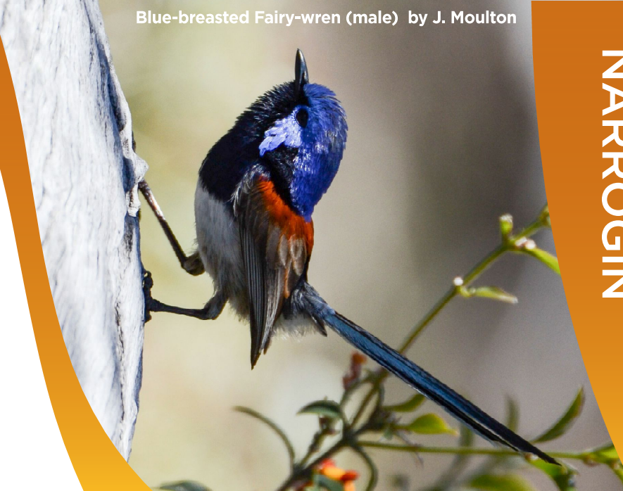
Blue-breasted Fairy-wren (male) by J. Moulton