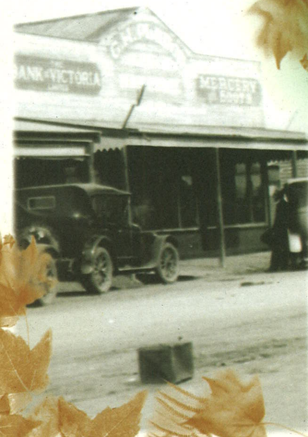
Lockington Main Street Circa 1920