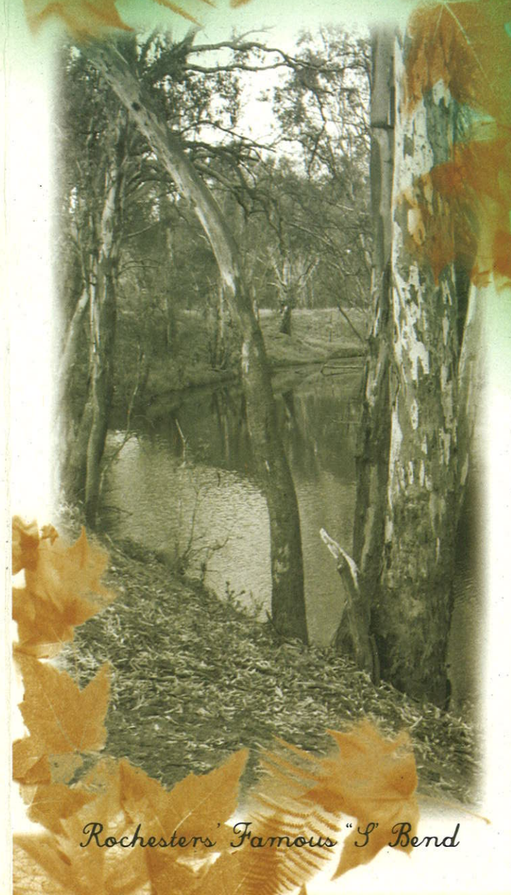
Rochesters' Famous "S" Bend