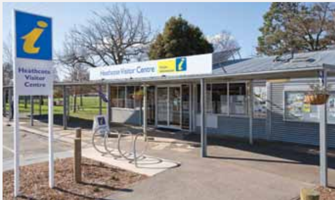
Visitor Information Centre