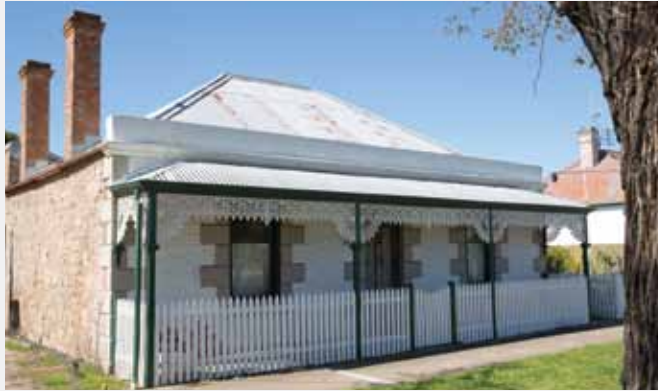
Historic site of District Road Board meetings