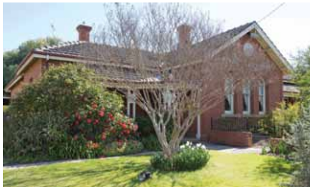
Historic Post Office

Modern day Heathcote benefits from beautiful architecture, picturesque surrounds and rich, Cambrian soil producing a local food and wine industry that is known globally to be one of the very best.