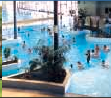
Oasis Recreational Centre

DISTANCE FROM CENTENNIAL PARK: 2.4 km along Gribble Creek cycleway. Access also available via Johnston Street. ATTRICTIONS: Recreational centre includes: Olympic sized indoor heated pool, separate toddlers pool, spa, sauna, stadium, fitness centre, aerobic, crèche, cafeteria, external netball courts and ovals. FACILITIES: Shade, family BBQ grassed area, rubbish bins, seats, toilets, bicycle parking facilities, children's playground equipment and drinking fountains. SUITABLE: for cycling around centre. For further information: contact Oasis on (08) 9022 2922