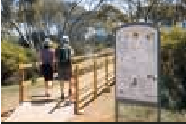
Karlkurla Bushland Park