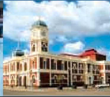
Boulder Town Hall

DISTANCE FROM CENTENNIAL PARK: 3.4 km via Gribble Creek pathway to Burt Street, then 0.8 km along Burt Street (path proposed). ATTRICTIONS: Beautiful historic building opened in 1908. The Goatcher curtain is the last remaining Phillip Goatcher drop curtain. FACILITIES: Shade, rubbish bins, seats and telephone. For further information: contact Boulder Town Hall on (08) 9021 1966