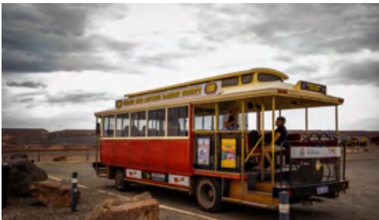
City Tram Tours available at the KBVC