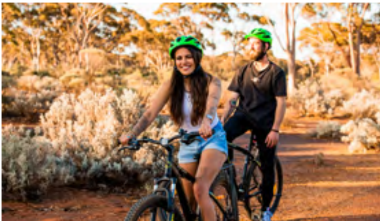
Bike Hire available at the KBVC