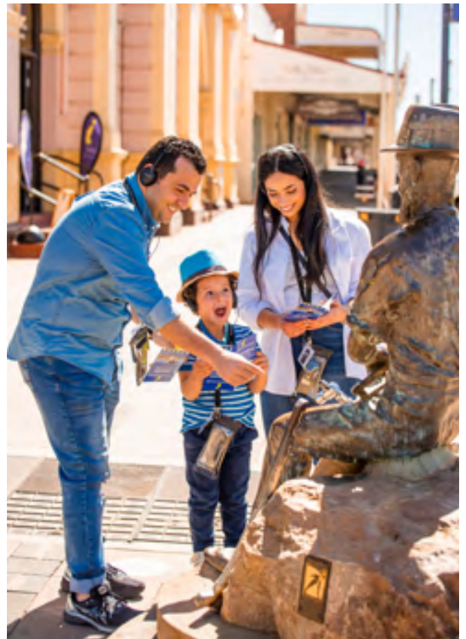
Audio Walking Tours available at the KBVC