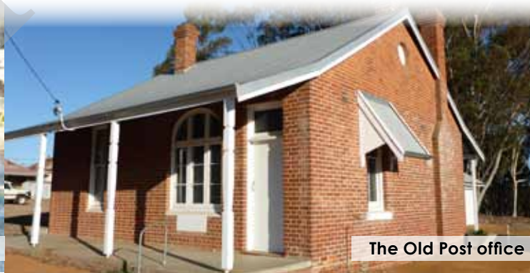
The Old Post office

The 'Old Post Office' is now the headquarters of the Kojonup Historical Society where archives are stored, research is carried out, historical photos are displayed and meetings are held first Monday of each month.