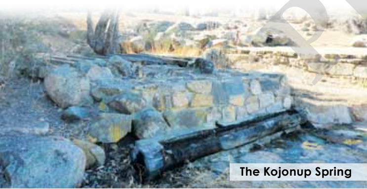
The Kojonup Spring

Used by the local indigenous people and later the early settlers as a watering place, this area is a significant historical site. The bridge, reservoir and a park were built in the 1980's.