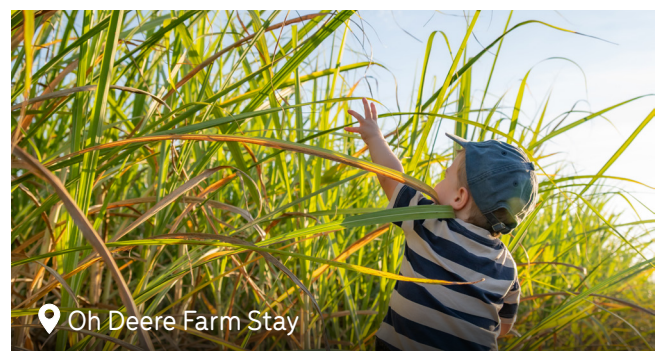
📍 Oh Deere Farm Stay

Join Mackay Adventure Tours for their Beach Sunrise with the Wallabies tour to Cape Hillsborough and/or their Platypus Paradise Tour through Finch Hatton and Eungella.