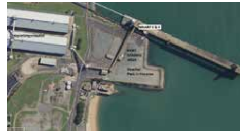
Image 3: Aerial view of Port of Mackay Wharf 3 and 4.