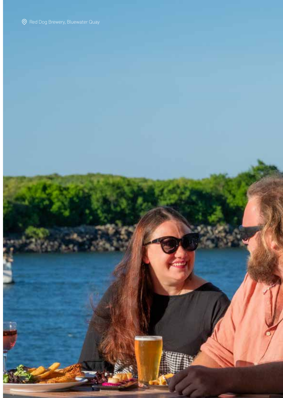
📍 Red Dog Brewery, Bluewater Quay