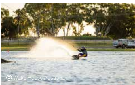
📍 Wake House Australia