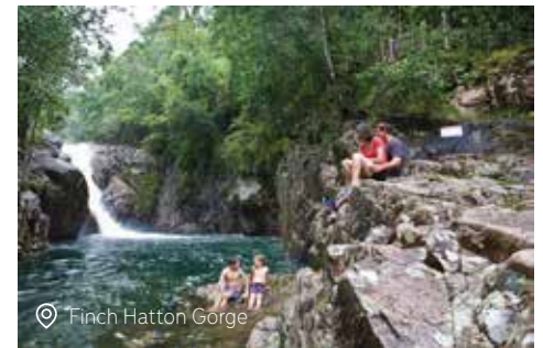
Finch Hatton Gorge

Lookout for a stunning view across the rainforest canopy and into the Pioneer Valley. Next stop is Broken River which flows through dense rainforest in the heart of the Eungella National Park. It's a short walk to the viewing area overlooking the river, and while we make no promises you may be lucky to spot the elusive platypus which lives in this river. Time to return to the coach and it's a 60-minute drive back down the range, through the valley and back to the port.