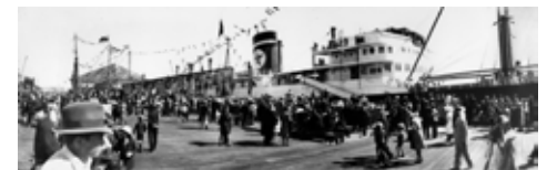
Image 1: Image of the Sydney Star, the first passenger ship to arrive at the Port of Mackay for the opening ceremony, 26 August 1939.

Independent guests will meet back at Mulherin Park for coach transfer back to the Cruise Ship.