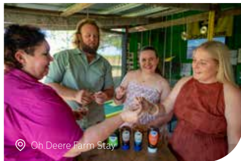
Oh Deere Farm Stay

This tour will provide an insight into the life of a sugar cane family and their production of sugar cane. Endless stories capture the essence of what it means to be sugar cane farmers with laughs and information to make the time memorable. The tour includes exploring the farm, driving through the rows of sugar cane, stopping at the sugar cane sidings, a visit to the 15 acre farm dam, a photo on the love swing, and a visit to the farm museum where guests can squeeze and taste sugar juice directly from sticks of cane. The museum houses an original collection of John Deere memorabilia (hence the farm name Oh Deere). Lunch will be served on this tour at the farm. After leaving the farm drive via the scenic northern beaches of Mackay before returning to the port to rejoin the Cruise Ship.