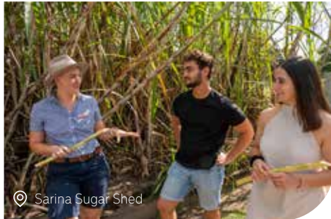
Sarina Sugar Shed

Leave the port and just 1 hour south of Mackay arrive at coast and pass by Grasstree Beach heading towards Hay Point Lookout. Hay Point is one of the largest coal export ports in the world and from the lookout, you'll see huge piles of coal, long conveyor systems and enormous cargo ships being loaded. It is a contrast between industrial engineering and the surrounding ocean. Leaving Hay Point we follow the coast north through lush green rolling hills, wide open spaces, sugarcane fields, and pockets of bushland. It's a peaceful, scenic drive that gives you a real sense of rural life in the local area. Arriving at Sarina Beach in time for lunch with a beachfront view at the Palms Restaurant. After lunch it is off to the Sarina Sugar Shed to learn about the local sugarcane industry, see working mini-mills, and enjoy tastings of Sugarcane juice, locally made rum and liqueurs (optional) as well as sauces, chutneys and jams. From the Sugar Shed it is a 30 minute drive back to the port.