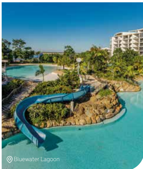
📍 Bluewater Lagoon