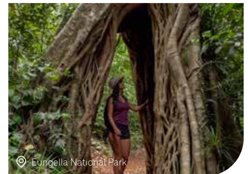
Eungella National Park