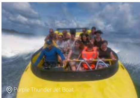
📍 Purple Thunder Jet Boat

Hospital Bridge on Bridge Road is a 15x11-metre platform, complete with rod holders and seating which allows anglers to access deep water out from the shallow riverbank. Within casting distance you'll also find an artificial habitat reef. There are plenty of fish species such as bream, cod and perch.