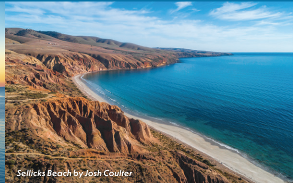
Sellicks Beach by Josh Coulter