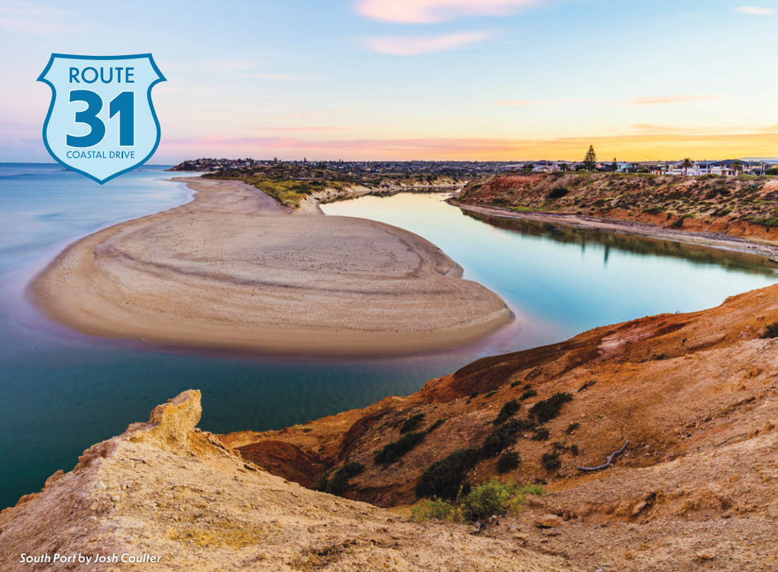
South Port by Josh Coulter

McLaren Vale and Fleurieu Coast is one of the best coastal destinations in South Australia. But don't take our word for it, discover it for yourself. There is a beach just waiting for you.