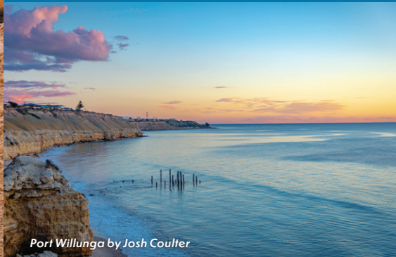
Port Willunga by Josh Coulter

McLaren Vale and Fleurieu Coast is one of the best coastal destinations in South Australia. But don't take our word for it, discover it for yourself. There is a beach just waiting for you.