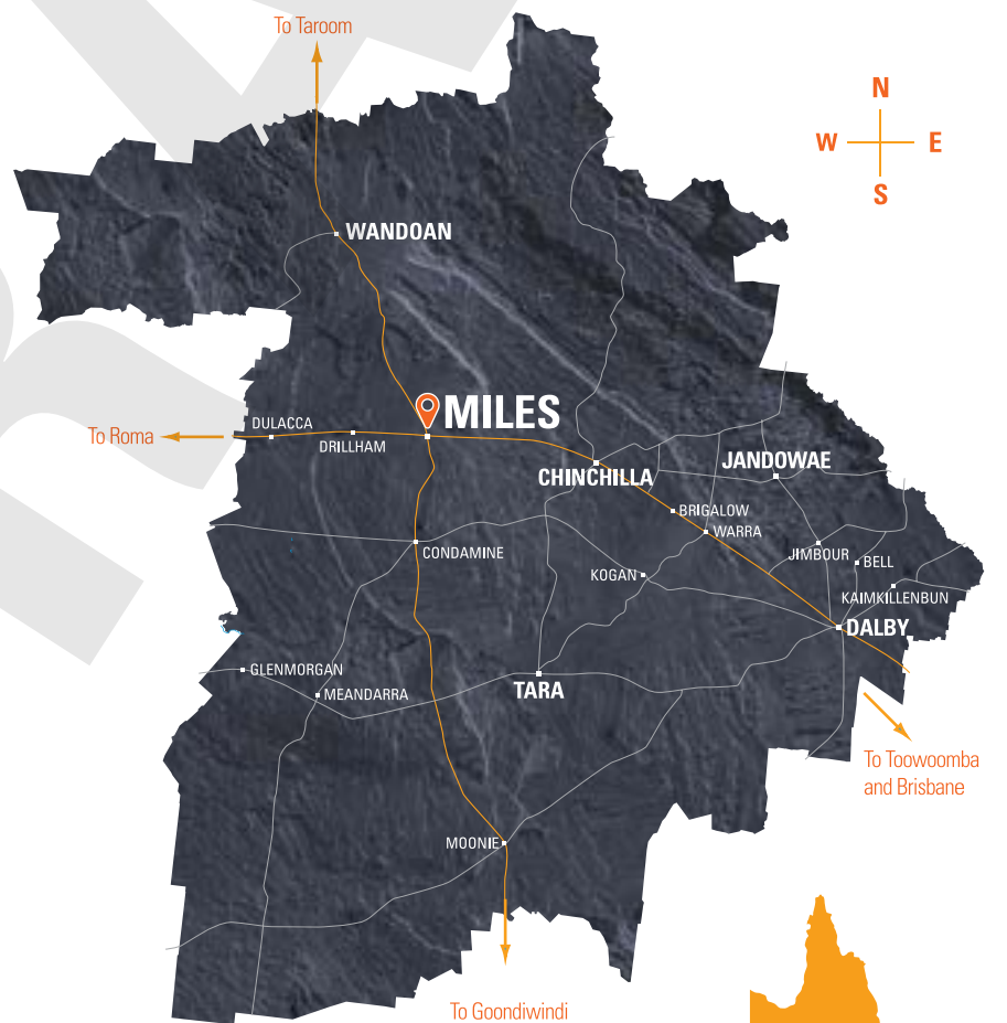
MAP OF WESTERN DOWNS REGION

Miles, in the heart of the Western Downs is the perfect venue for the 2021 QICA Conference.