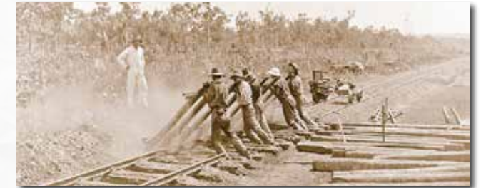
Putting in new siding for the farm, the first break in the line for 16 years, 1912 Federal Parliamentary Party Visit 1912. PH100/0069