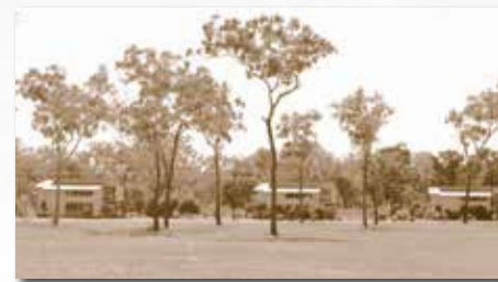
View across the oval towards the Mine Manager's house, 1957