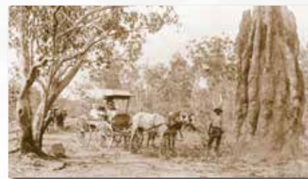
Termite Mound, Rum Jungle, 1887 Photograph courtesy of the State Library of South Australia. SLSA: 8 5047