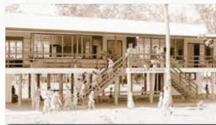
Batchelor Primary School, 1957 From the collection of the National Archives of Australia, Neil Murray Collection, Naa: A1200. L23821