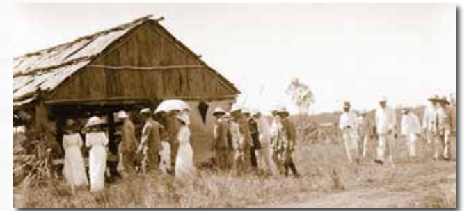
"Entering to lunch provided by the farm hands". Shows the Federal Parliamentary Party at the Government Experimental Farm shortly before the first World War 1912 Federal Parliamentary Party Visit 1912. 24282472