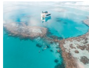
Heart Island You can now experience the famed Heart Reef up close and personal.