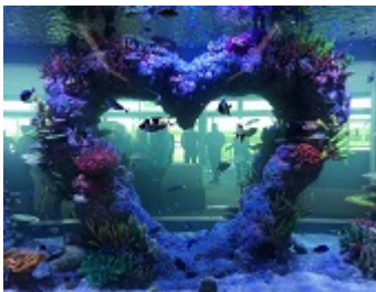
Whitsunday Coast Airport A 30,000 litre aquarium plus so much more which is part of a $15 million terminal expansion.