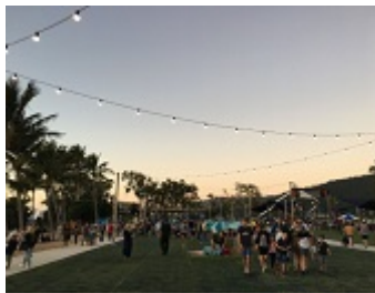
Airlie Beach Foreshore After a huge redevelopment the Airlie Beach foreshore is looking better than ever!