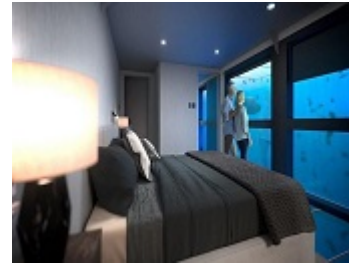
Cruise Whitsundays Rooms with a View: Introducing Underwater Suites on the Great Barrier Reef.