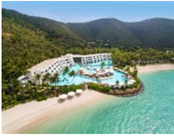
Intercontinental Hayman Island Resort Is now open!