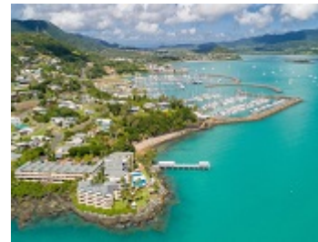
Coral Sea Marina Resort The merge of two of Airlie Beach's most loved icons.