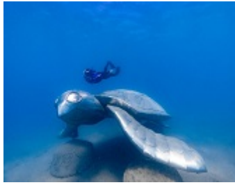
Underwater Sculptures A Great Barrier Reef first right here in The Whitsundays!