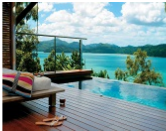
Hamilton Island qualia listed as Best Luxury Resort in Australia