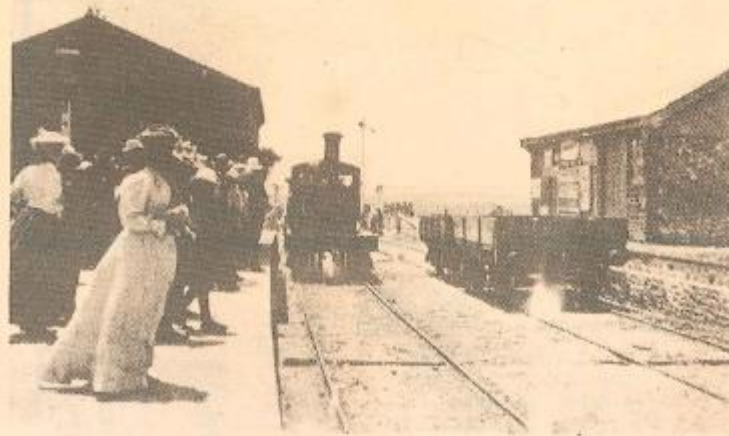
Original Railway Station c. 1900