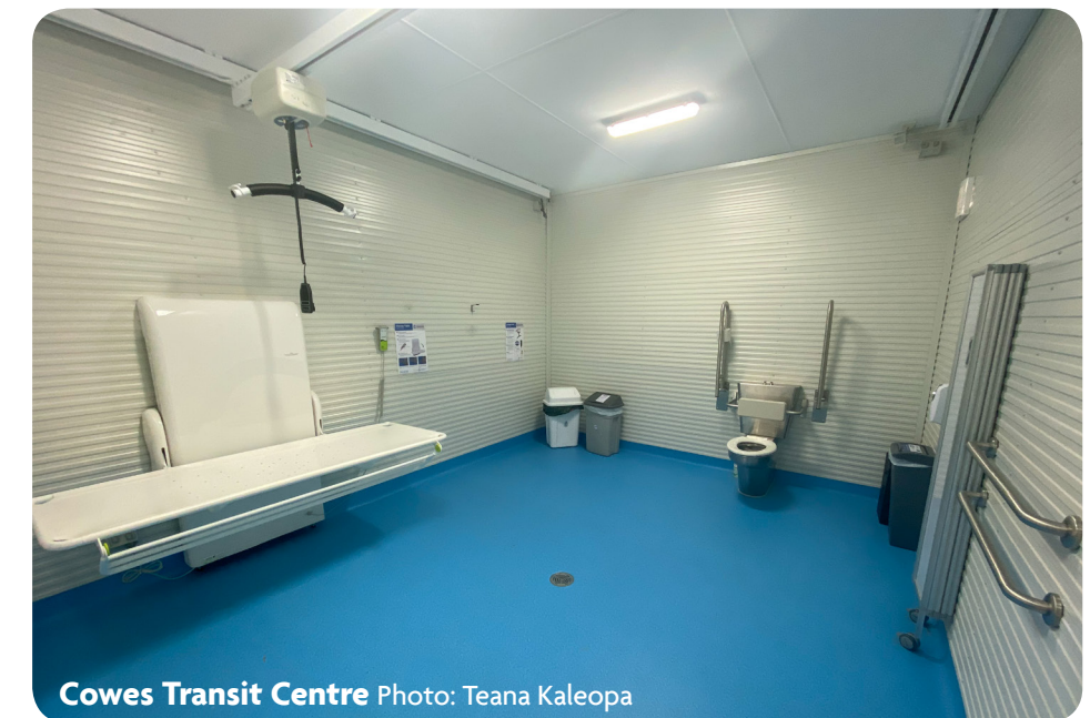
Cowes Transit Centre