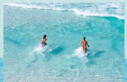
Swimming at Esperance Beach