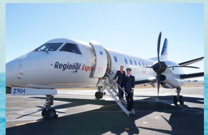
REX Plane