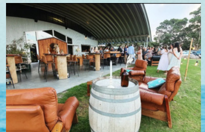
Lucky Bay Brewing

ARRIVE BACK AT THE JETTY RESORT FOR A WELL DESERVED REST AND ENJOY AN EARLY NIGHT IN.