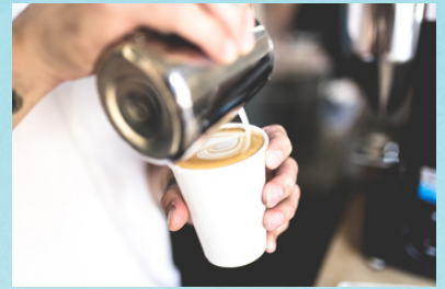
Barista Coffee

ARRIVE BACK AT THE JETTY RESORT TO FRESHEN UP BEFORE HEADING TO 33 DEGREES TO ENJOY DINNER AND DRINKS WITH BEAUTIFUL VIEWS OF THE ESPERANCE FORESHORE.