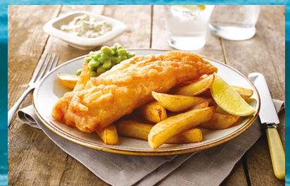
Fish & Chips