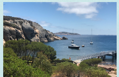
Woody Island