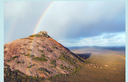
Frenchman Peak