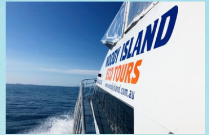
The Boat

PLEASE DON'T FORGET TO TELL YOUR FRIENDS AND FAMILY WHAT A FANTASTIC TIME YOU HAD IN ESPERANCE!