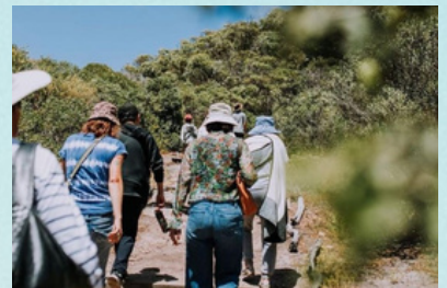
Guided Walking Tour | Source: @woodyislandecotours