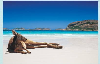
Kangaroo at Lucky Bay

OPTIONAL : LIVE LOCAL MUSIC EVERY FRIDAY & SUNDAY FROM 3PM. (WALK-INS WELCOME)