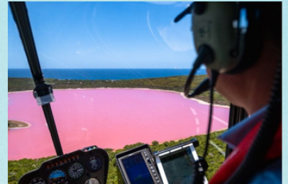
Aerial of Middle Island