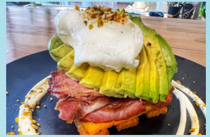
Café Breakfast

ENJOY A HOT COFFEE & FILLING BREAKFAST FROM BREAKAWAY CAFE ON DEMPSTER STREET. (BOOKINGS ARE RECOMMENDED)