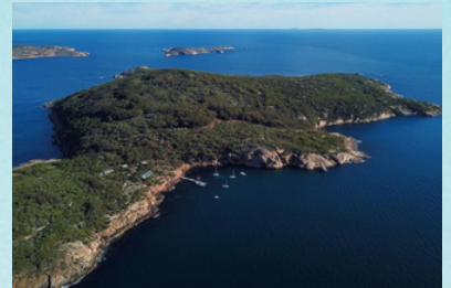
Woody Island