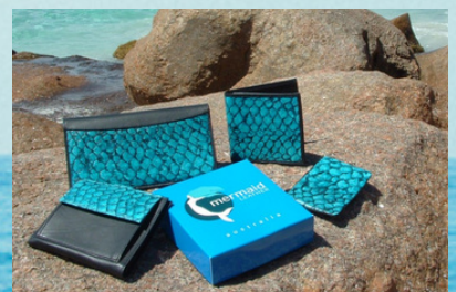
Mermaid Leather Wallets