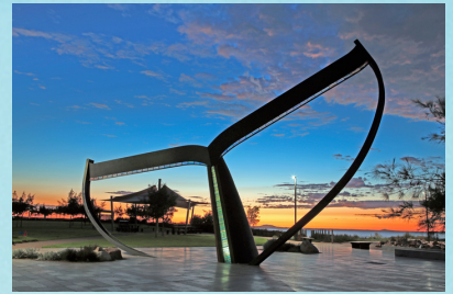
Whale Tail

PICK UP FISH & CHIPS FROM FISH FACE & ENJOY A SUNSET DINNER AT A PICNIC TABLE ALONG THE FORESHORE. OPTIONAL : DINE IN AT FISH FACE. (IF AVAILABLE).