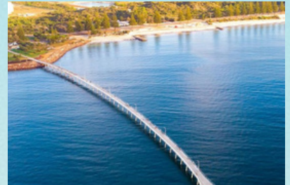
The Tanker Jetty