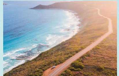
Great Ocean Drive