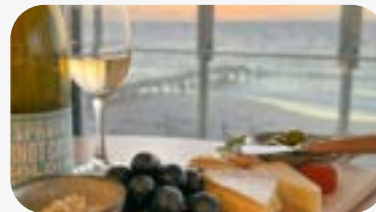
Normanville Surf Club

We hope you enjoyed your time on the Fleurieu Coast! Share your adventures with us by tagging us on: