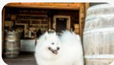
Smiling Samoyed Brewery

Reward yourself with a well-earned lunch at Smiling Samoyed Brewery, where you can enjoy handcrafted beer and hearty pub-style meals overlooking the water (and maybe even meet their friendly Samoyed!)