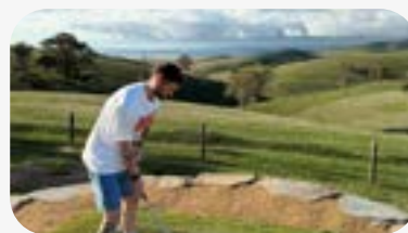
Fleurieu Gin (Driving Range)