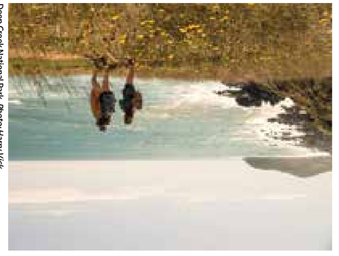
Deep Creek National Park.