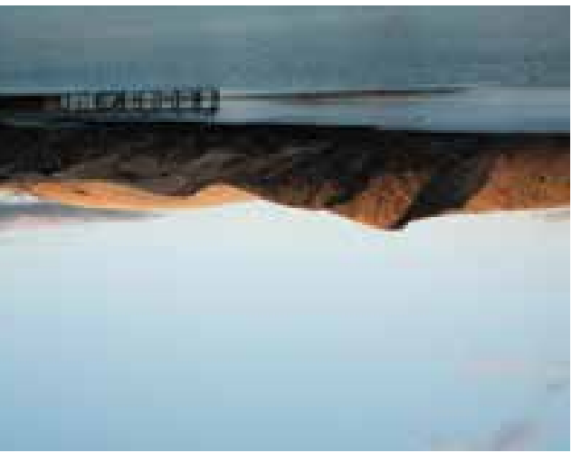
Second Valley.