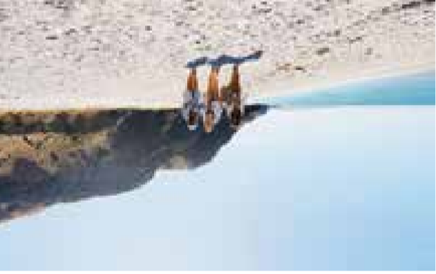
Rapid Bay.

YANKAILLA G3 Yanakilla Craft and Produce Market