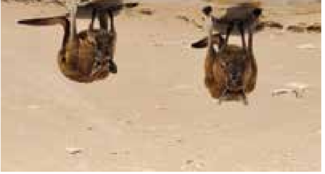
Kangaroos at Blowhole Beach.