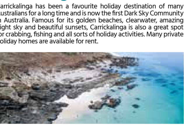
Carrickalinga Beach.

Carrickalinga has been a favourite holiday destination of many Australians for a long time and is now the first Dark Sky Community in Australia. Famous for its golden beaches, clearwater, amazing night sky and beautiful sunsets, Carrickalinga is also a great spot for crabbing, fishing and all sorts of holiday activities. Many private holiday homes are available for rent.