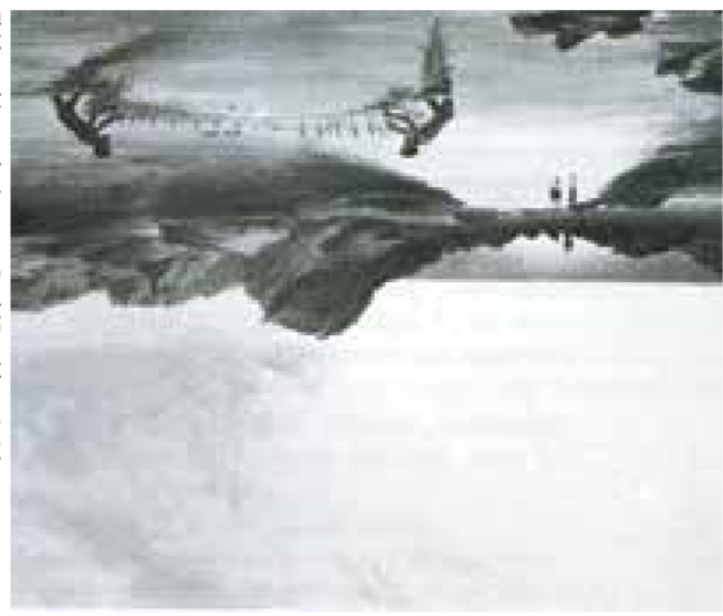
Fishing with nets in the sea at Rapid Bay (circa 1840s).