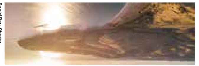
Rapid Bay, Photo: Jean Crosswell

and from the coast to the Mount Lofty Ranges, is the traditional land of the Kaurua people, who have lived here for thousands of years. Traditionally, they lived in independent groups within their own lands, coming together for trade, social, ceremonial and religious reasons. The Kaurua people lived by the coast in summer months and moved to the foothills in the colder weather for better shelter and firewood. The inland areas also contained more mammals to hunt, and creeks and swamps contained fish and other water life. Their well-established travelling tracks are reflected in some of the region's road routes today.