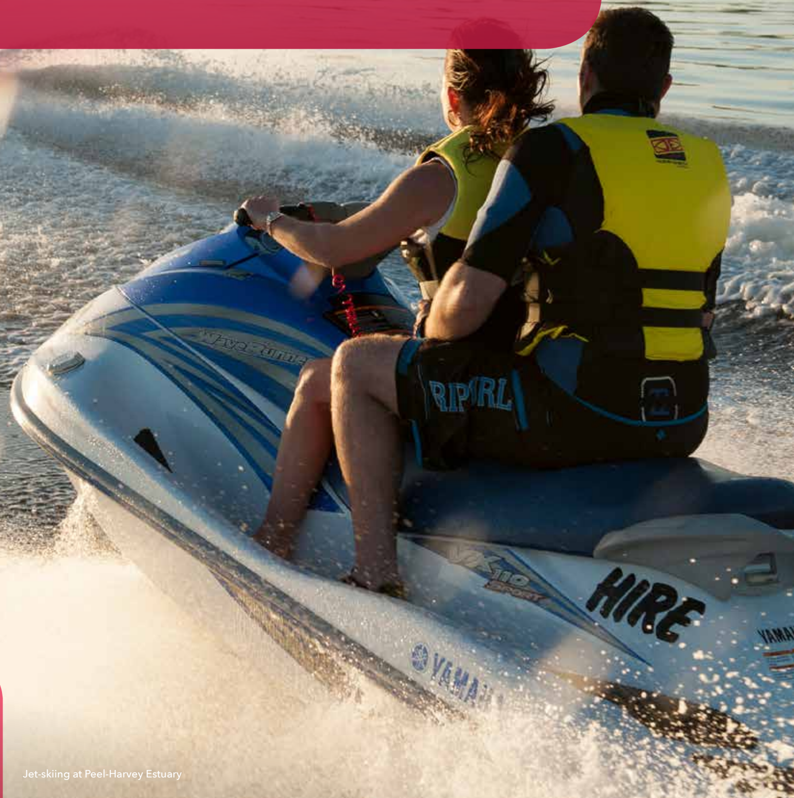
Jet-skiing at Peel-Harvey Estuary

This region is bursting with fantastic opportunities to get your team out of the conference rooms and into the great outdoors. Choose from adrenaline rushes, something cruisy, or simply wine and dine.