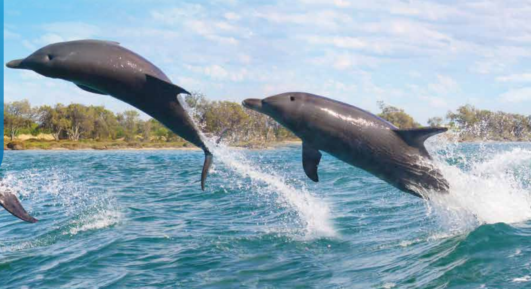
Happy Bottlenose dolphins in Mandurah Estuary