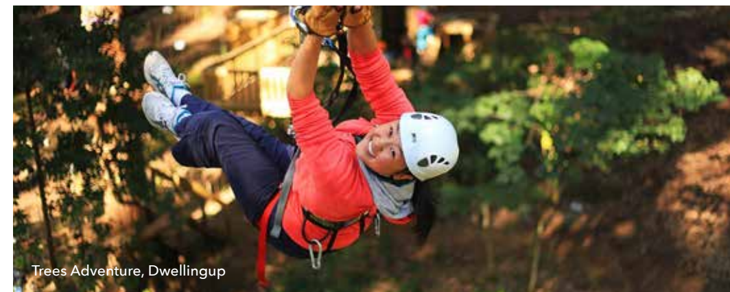
Trees Adventure, Dwellingup