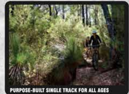
PURPOSE-BUILT SINGLE TRACK FOR ALL AGES