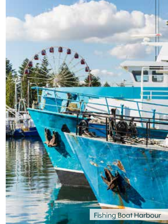
Fishing Boat Harbour

The Victoria Quay precinct on Fremantle Harbour is home to the E Shed Markets and WA Maritime Museum. Ferries to Rottnest Island leave regularly from B Shed and cruise ships from the Fremantle Passenger Terminal.