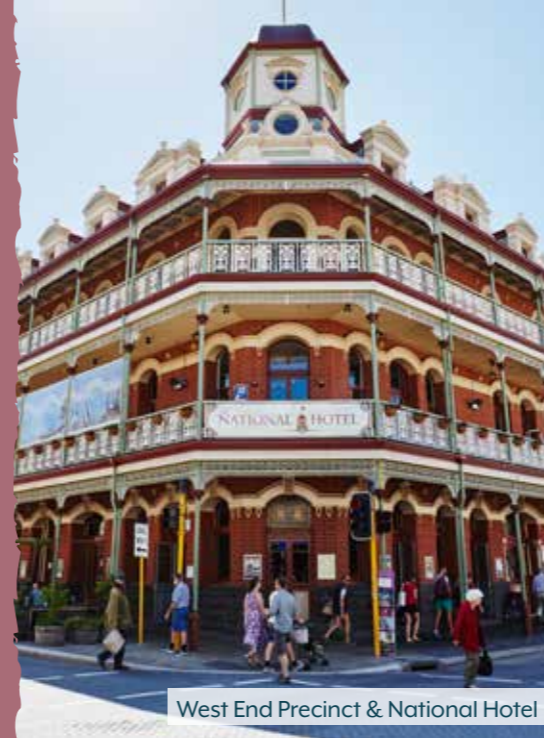
West End Precinct & National Hotel