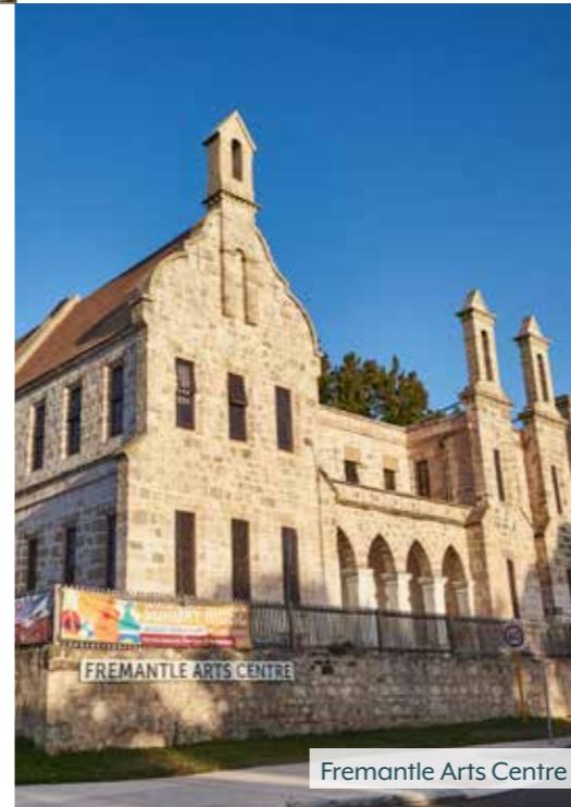
Fremantle Arts Centre

Opening hours: 7 days a week, 10am–5pm Free entry