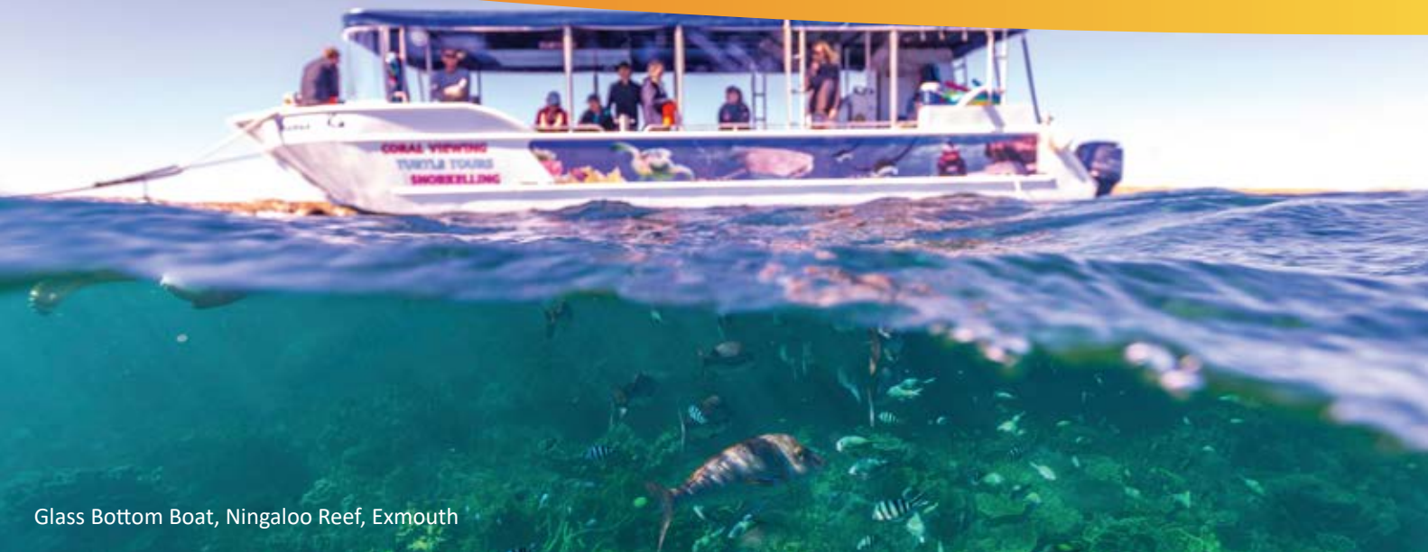
Glass Bottom Boat, Ningaloo Reef, Exmouth