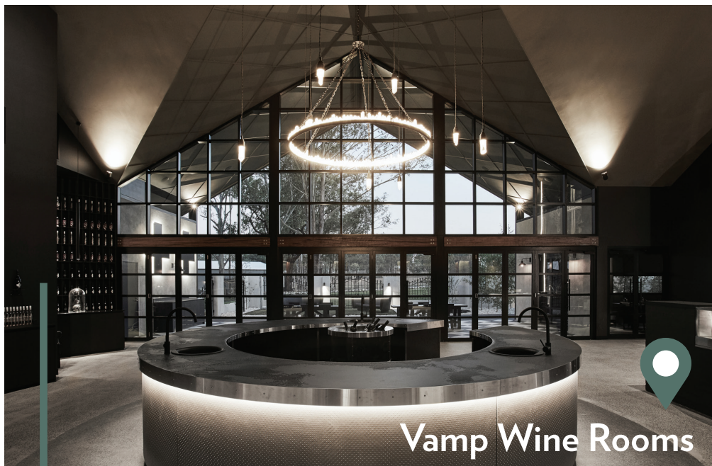
Vamp Wine Rooms